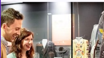
Country Music Hall of Fame