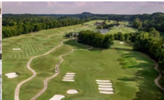
Gaylord Springs Golf Links