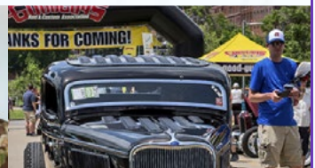
Goodguys Nashville Nationals Car Show & Race