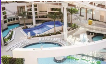
SoundWaves Water Park