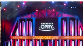
Grand Ole Opry