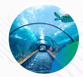
Grapevine Sea Life Aquarium