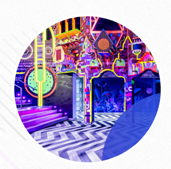
Meow Wolf Grapevine